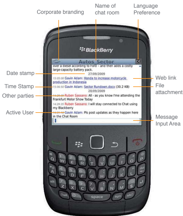
Figure 1. Typical chat room

Formicary Mobile Chat complements OCS 2007 R2 Group Chat by providing users access to Group Chat and presence through mobile devices. Formicary Mobile Chat enables users to stay in contact with their teams whilst on the move, reducing phone, email usage and their associated costs.