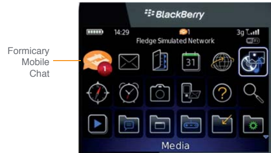
Figure 2. Menu